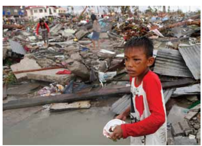
People trying to rescue what they can in what once was their home.

But the dead are not the problem. The survivors don't have water, electricity nor food. Several groups are already coming in to help: Amurt and Red Cross among them. But they need resources to buy food, tents and medication.